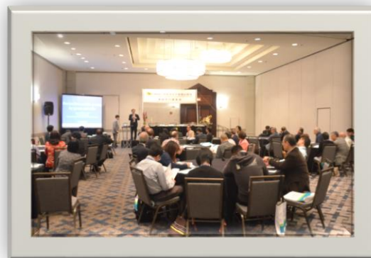
Members of CAPASUS participating in a wonderful discussion with the speakers.